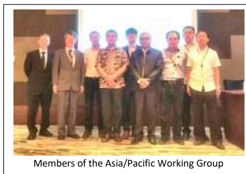
Members of the Asia/Pacific Working Group