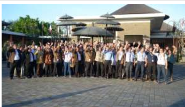
Picture 1: Taking picture in front of Sofitel after symposium closing

A MEMORABLE EVENT OF SHARING KNOWLEDGE, IDEAS AND MOMENTS