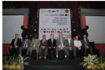
Some members of the new Board of Directors

All symposium presentations, in PDF format, are available on the Fisuel website http://www.fisuel.org/