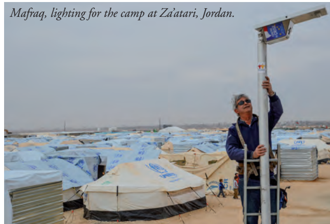
Mafraq, lighting for the camp at Za'atari, Jordan.

The actions of "Electriciens sans frontières" are made possible through the support of public and private participants, men and women who invest in favour of energy for all. Some of these provide financial support, others encourage their employees to support the work or becoming actively involved. Others raise awareness among their customers and suppliers about the actions undertaken in favour of access to energy supplies. "Electriciens sans frontières" ensures that appropriate, customized solutions are proposed which meet the particular motivations and expectations of each case.