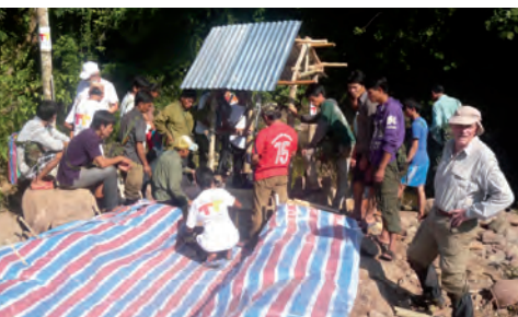
Green energy for 30 provincial villages. People's Democratic Republic of Laos.

been working since 1986 to reduce world poverty through energy access projects.